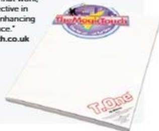
T.One Transfer Paper from TheMagicTouch