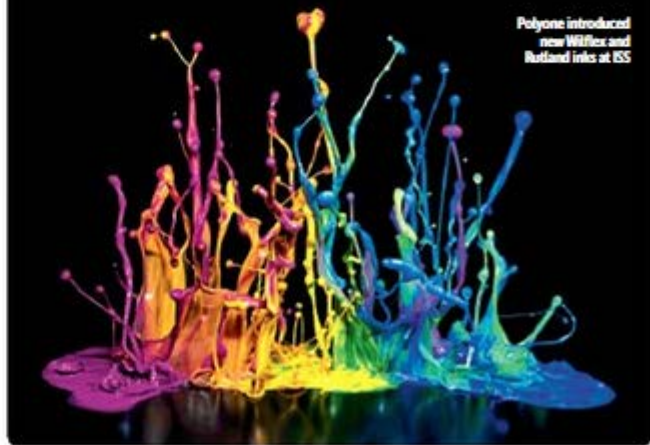
PolyOne introduced new Wilflex and Rutland inks at ISS