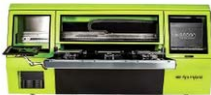
The new Kyo Hybrid printer from Aeoon