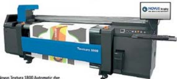
Novus Textura 1800 Automatic dye sublimation printer from M&R